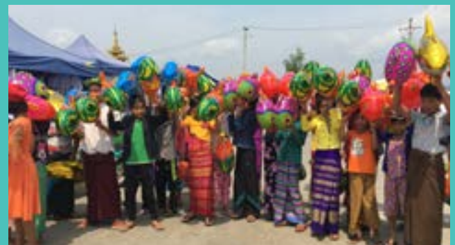
2018 Myanmar

Events take place around the world and details of each event are listed on the World Fish Migration Day website. Find one near you! There are a range of activities planned and participating organisations are encouraged to invite others to take part in their events.