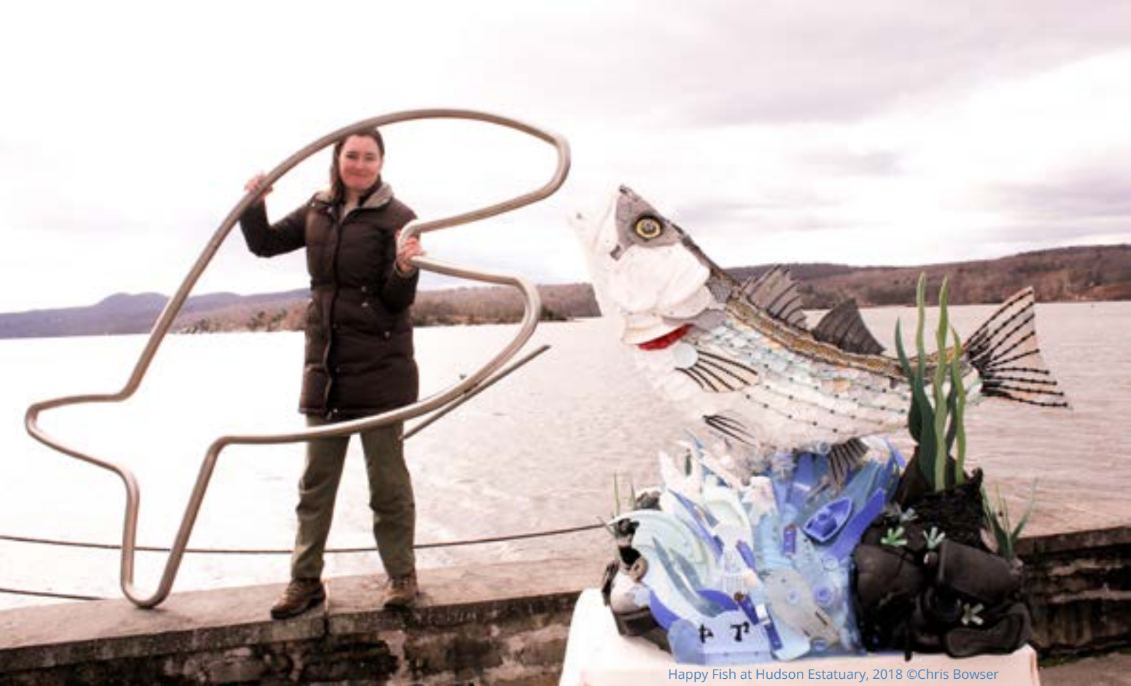
Happy Fish at Hudson Estuary, 2018