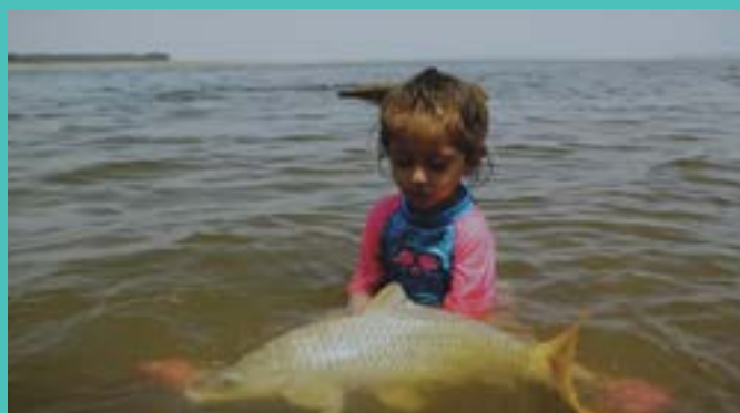
2014 India

Follow us on Facebook and Twitter to keep up to date with all the latest World Fish Migration Day activities and share the news with colleagues, friends and family. Also, be sure to spread the word about your local events and our key message to media outlets! We cannot wait to hear what you're up to and know others are excited too—please use #worldfishmigrationday and #happyfish on social media.