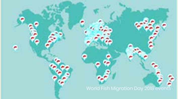
World Fish Migration Day 2018 events

of World Fish Migration Day, “Connecting fish, rivers and people” will be used to connect sites around the world. The day will start in New Zealand and follow the sun around the world, ending in Hawaii.