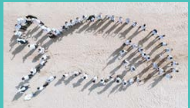
2018 Paraguay

On www.worldfishmigrationday.com you can download all kinds of Happy Fish materials to use during your event to help spread the word and make people enthusiastic about Happy Fish. If you are posting on social media don't forget to use #happyfish and #worldfishmigrationday .