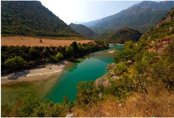
Vjosa (Albania)