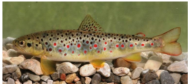
Black Sea salmon (Salmo labrax)

Where: The location of the conference is not yet determined, but it will most likely take place in Sarajevo or Belgrade.