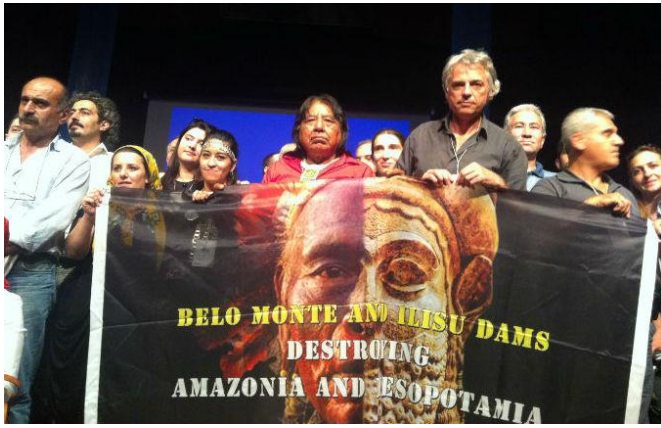
2013 Istanbul: Launching of the initiative “Damocracy!” against the international dam hype, together with dedicated people from Amazonia, Patagonia, Kenya, USA and Turkey.