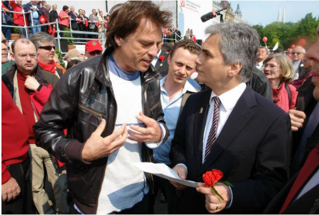
May 1, 2009 Stop Ilisu protest on International Worker's Day in Vienna with Chancellor Werner Faymann.