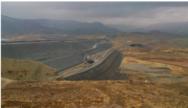
2013. However, Turkey insists on Ilisu and continues the construction on its own. In 2015, Hasankeyf is to be drowned in the reservoir.

In Juni 2009 Germany, Austria and Switzerland, as well as the European Banks and companies withdraw from the project. For the first time in the history of export industry, existing contracts are being cancelled due to environmental and social concerns. Solely the Austrian Andritz Group remains in the Ilisu business.