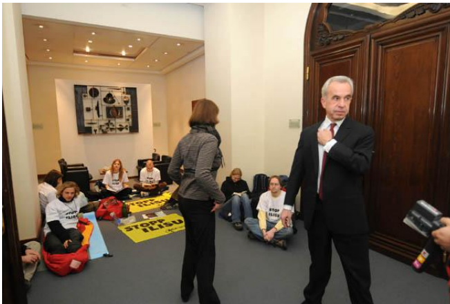
2009 Vienna Sit-in at the Austrian Kontrollbank AG (ÖKB) stress the demand for withdrawal from Ilisu. On the right, ÖKB board of directors member Rudolf Scholten.

In Juni 2009 Germany, Austria and Switzerland, as well as the European Banks and companies withdraw from the project. For the first time in the history of export industry, existing contracts are being cancelled due to environmental and social concerns. Solely the Austrian Andritz Group remains in the Ilisu business.