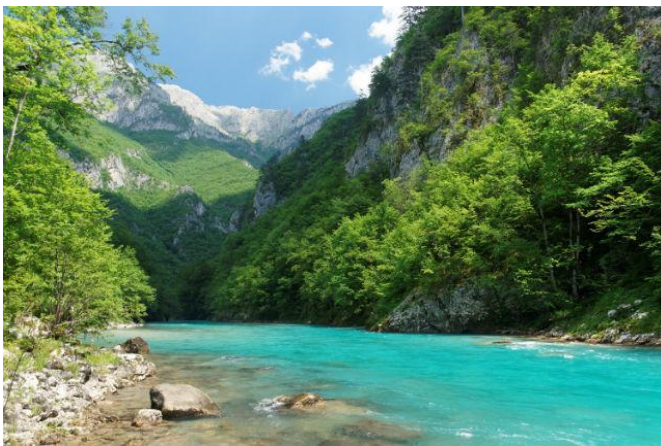
2013 “Save the Blue Heart of Europe”. Launching of a three-year campaign. The best preserved rivers of Europe are located on the Balkans. However, over 570 hydropower plants are projected, even inside national parks. In cooperation with local NGOs, Riverwatch and EuroNatur want to prevent this dam tsunami.