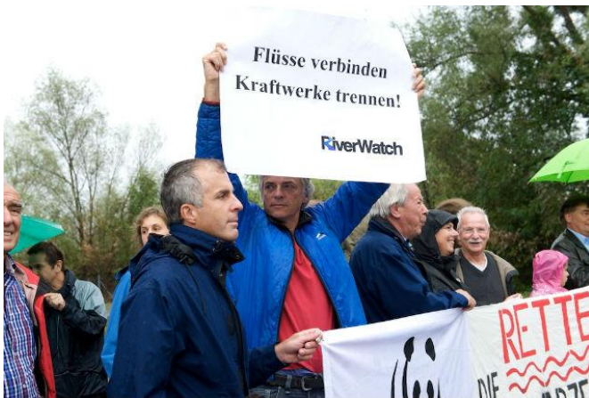
2013 Styria/Austria: protest against the hydropower project at the Schwarze Sulm River.