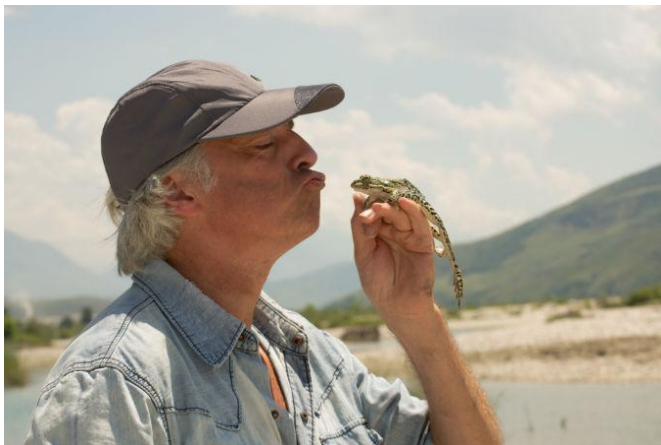
2014 Vjosa/Albania: One of the key areas of the Balkan campaign. Sometimes kissing doesn't help. It remained a frog... www.balkanrivers.net