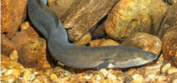
The critically endangered European Eel. Dams would cut off its main habitats in the Vjosa catchment.

Scientific knowledge about the Vjosa and its biodiversity is very limited. It is one of the least explored rivers in Europe: we might know more about the biodiversity of river systems in South America or Asia than we do about the Vjosa. Very few studies are at hand so far. But these few existing studies underscore the importance of the river valley as Albania's biodiversity hotspot providing ideal aquatic habitats for numerous species.