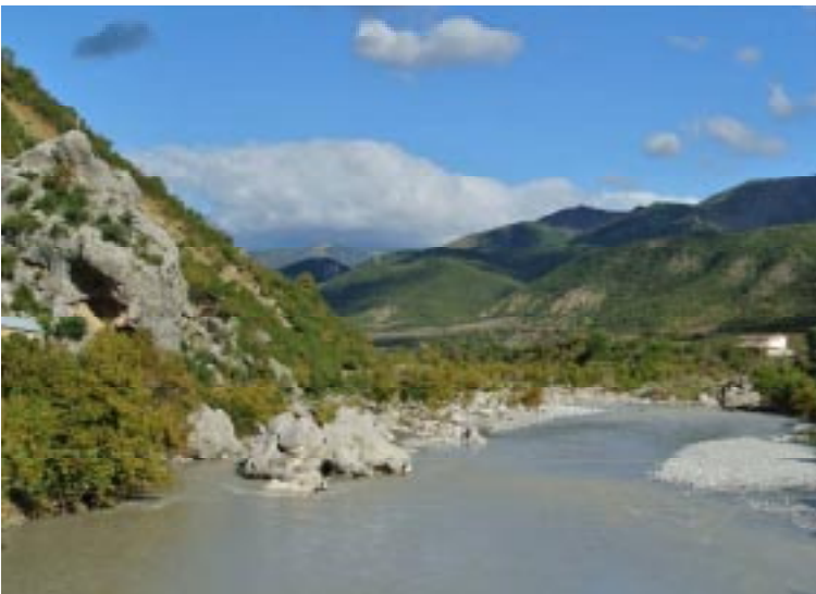
The uppermost dam construction site. The dam would flood parts of the old village of Kaludh. (Romy Durst)

The biggest threat for rivers is hydropower. More than 100 new hydropower dams are to be built in all of Albania. Along the Albanian river section of the Vjosa, the Ministry of Energy intends to build eight dams. In the upper part, the Greek government is planning a dam project with the aim to divert about 70 million cubic meters per year through the River Kalamas for irrigation purposes.