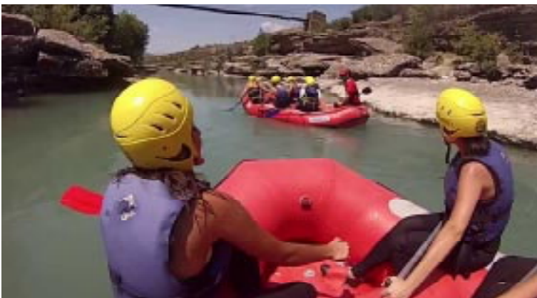
Rafting along the Vjosa.

The Vjosa River has a special and crucial place in the daily lives of the people that live along its banks. Its terraces provide the villages with fertile land for agricultural activities such as crop production and livestock farming. The abundance and diversity of fish is vital for the economy and the well-being of local fishermen. Recreational tourism on the Vjosa and its tributaries is ever-increasing, particularly in recent years in which enthusiasts have started to enjoy activities such as rafting, canoeing, kayaking, swimming, etc.