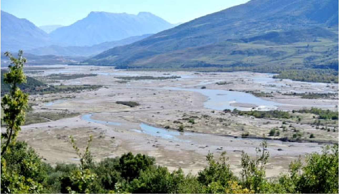
The extensive braided river section near Tepelena would drown in a reservoir of the future Kalivaç dam.

Europe's Wild jewel - beautiful, unknown and threatened