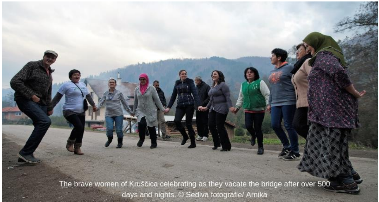
The brave women of Kruščica celebrating as they vacate the bridge after over 500 days and nights.

Victory for the "Brave women of Kruščica"! Shortly before Christmas we received good news for Balkan rivers: On December 14 th , the women of Kruščica in Bosnia and Herzegovina won a crucial court case. The permits for the construction of two hydropower plans have been cancelled; the dams must not be built. The women of Kruščica were able to vacate the bridge after over 500 days and nights of peaceful protests. MORE