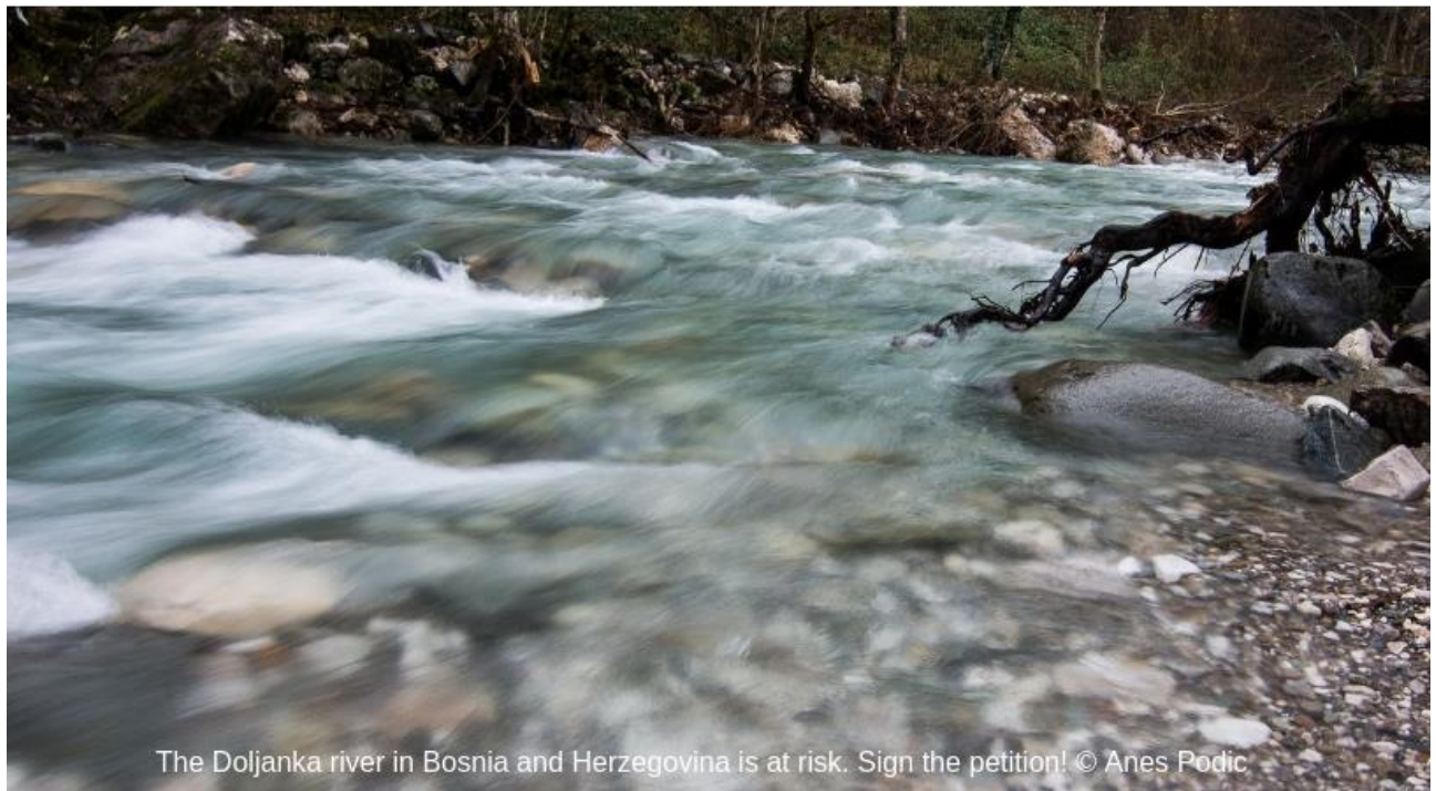
The Doljanka river in Bosnia and Herzegovina is at risk. Sign the petition!

Doljanka River! The Doljanka River in Bosnia and Herzegovina needs your help! Please sign this petition to protect it from a destructive hydropower project, which is financed by former NBA Player Mirza Teletović. PETITION