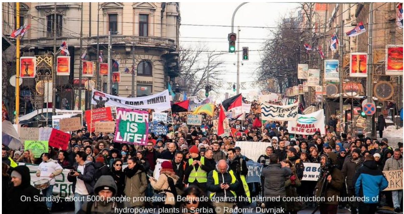
On Sunday, about 5000 people protested in Belgrade against the planned construction of hundreds of hydropower plants in Serbia

Protest in Serbia: We don't give you our rivers! In January, around 5,000 people took to the streets in Belgrade to protest against the sell-off of the rivers in Serbia, particularly against the planned construction of hundreds of hydropower projects. More than 850 hydropower plants are officially planned in Serbia, about 200 of which within nature reserves such as national parks, nature parks, etc. MORE