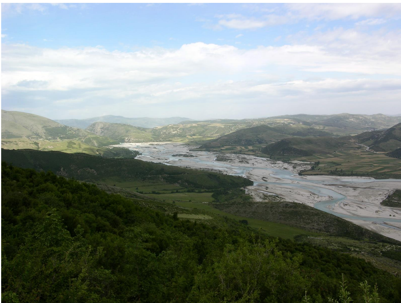
Vjosa River in the Poçëm area

Over 30 scientists from Albania, Austria and Germany conduct a week research at the Vjosa in Albania. With this activity, the scientists want to draw attention to the expected negative impacts of the projected dam construction at Europe's last big wild river and contribute to a proper EIA. An initiative like this is without par in Europe.