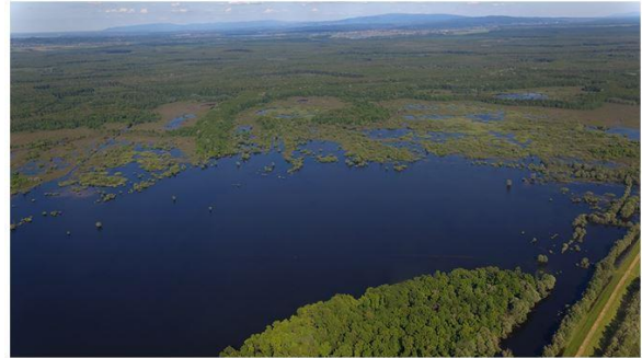
Sava's natural floodplains at Lonjsko Polje Nature Park.

In mid-September the Sava burst its banks once again. Read about the causes and the lessons to be learned in our press release . The Austrian newspaper „Der Standard“ picked up on the topic: „ Der trügerische Schutz der Flussrinnen “