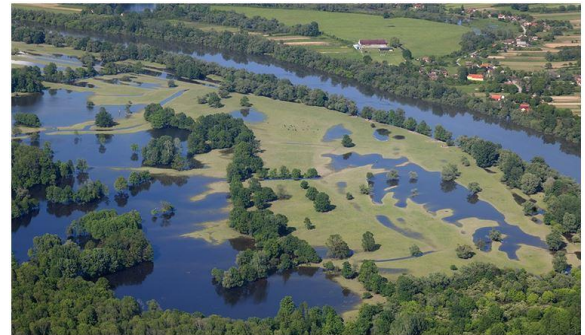
Sava at Lonjsko Polje Nature Park.

To supplement the Team Sava, the coordination team is currently looking for a national coordinator for Croatia and countries downstream (Bosnia& Herzegovina and Serbia). Find the job offer HERE .