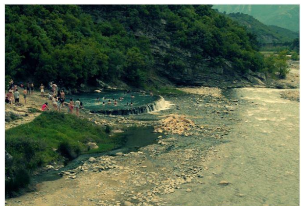
Natural springs along Langarica, AL.

The World Bank finances three dam projects on the Langarica (a tributary of the Vjosa River) inside the Fir of Hotova National Park, Albania. One is already completed, another under construction. As a result, thermal springs temporarily ran dry, causing dozens of people protesting against the dams in Tirana on October 11. Consequently, the Minister of the Environment promised to appoint a working group; however, constructions are in progress again.