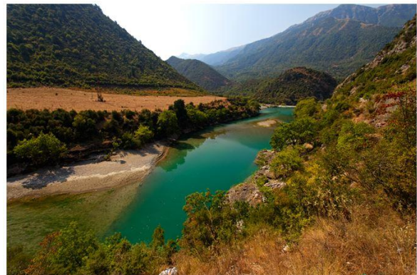
Vjosa River scenery.

The September print edition of the renowned German magazine GEO featured an article about the GEO Days of Biodiversity at the Vjosa River in Albania. Now, the article went online: Europas letzter wilder Fluss . Since it is available in German only, read our partial English translation .